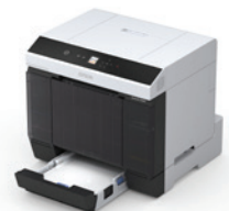
Optional duplex unit holds up to 100 double-sided sheets