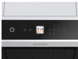
Flexible connectivity and a convenient control panel