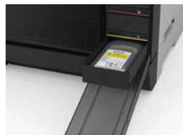
All-front-loaded consumables & large 250ml ink pouches