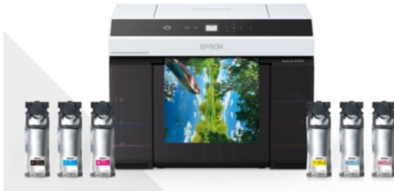
The 1060 uses high volume (250ml) ink, which reduce waster and extend

Duplex media: A5 (2 x 400 sheets); A4 (2 x 400 sheets); 4x6-inch (2 x 400 sheets); 5x7 (2 x 400 sheets); 8x10 (2 x 400 sheets); 15.2cm x 15.2cm (400 sheet); 21cm x 21cm (400 sheets)