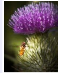
Native Bee by Kathryn Steinhardt

-We present outstanding images from the recently-completed Tamron Best Shots competition