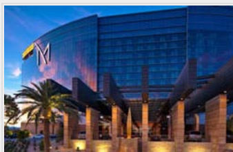
The M Resort, Las Vegas, is home to the first International IPI conference.